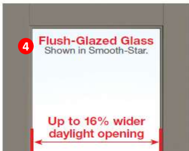
4 Flush-Glazed Glass Shown in Smooth-Star.