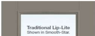
Traditional Lip-Lite Shown in Smooth-Star.